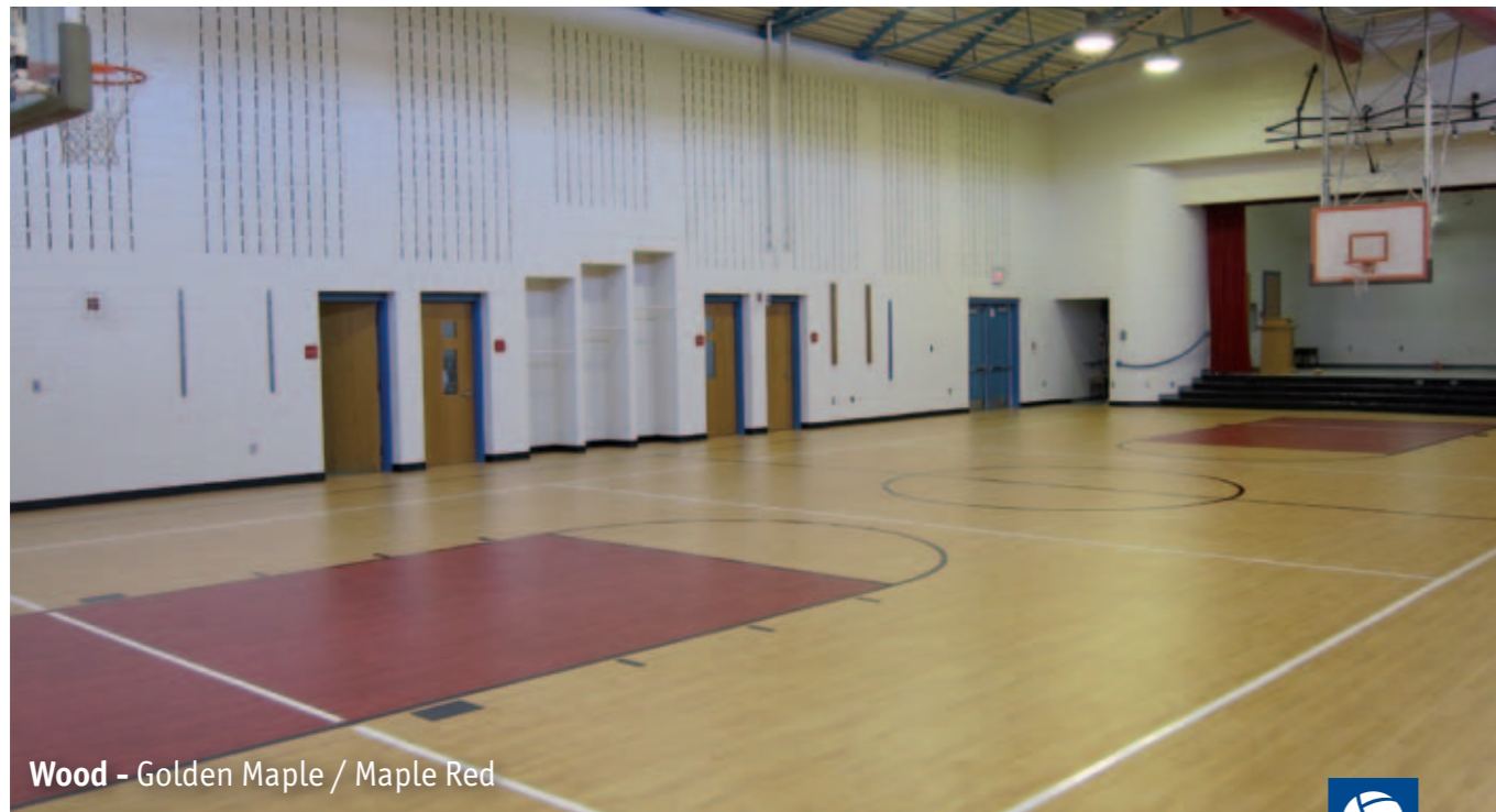
Wood - Golden Maple / Maple Red