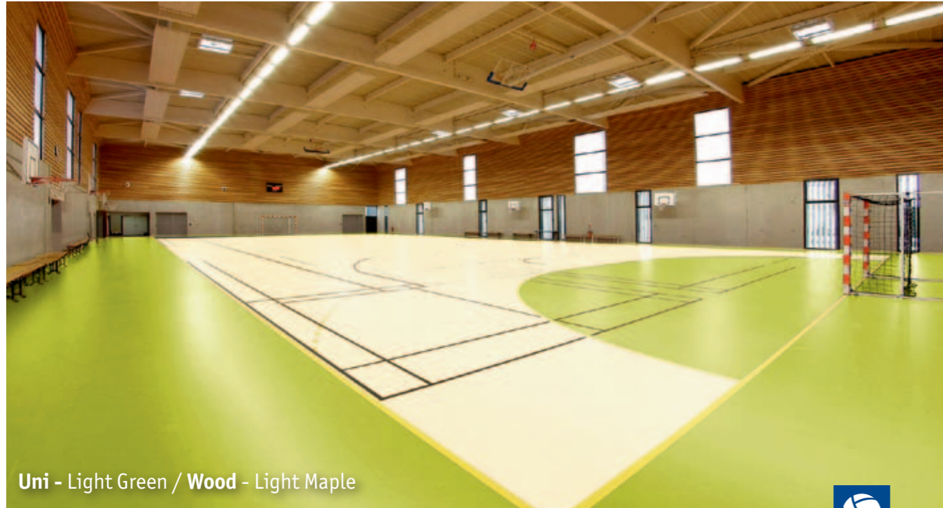
Uni - Light Green / Wood - Light Maple